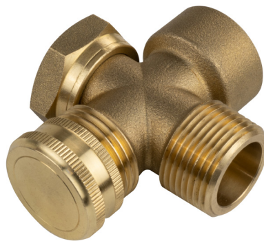
3/4" FIP Swivel 1 x 3/4" MIP x 3/4" MHT (cap) x 3/4" FIP