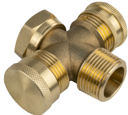
3/4" FIP Swivel 1 x 3/4" MIP x 3/4" MIP (cap) x 3/4" MHT (cap)