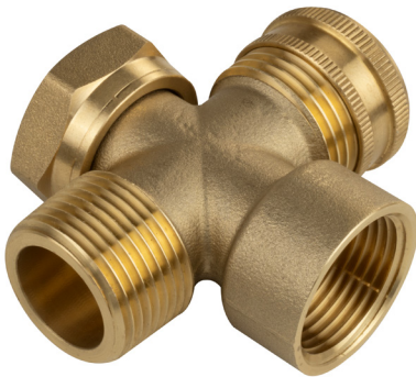
3/4" FIP Swivel 1 x 3/4" FIP x 3/4" MIP x 3/4" MHT (cap)