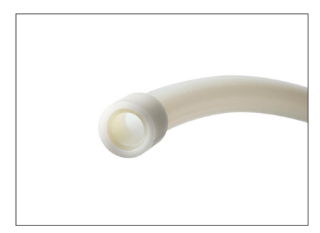
2. Install an approved PEX expansion sleeve onto OD of tubing.