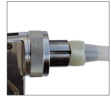
Failure to rotate tool inside tubing may cause unequal expansion. Remove any rings with unequal expansion.