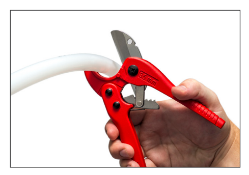
1. Cut tube at 90-degrees. Do not crush OD of tubing with cutters. Hint: Slightly rotate cutter during blade engagement.