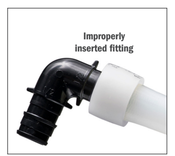
Be sure tubing is cut squarely, tube is inserted into sleeve completely and fitting is inserted fully into tube/sleeve.