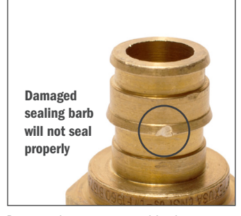
Damaged, cut or grooved barb on fitting.